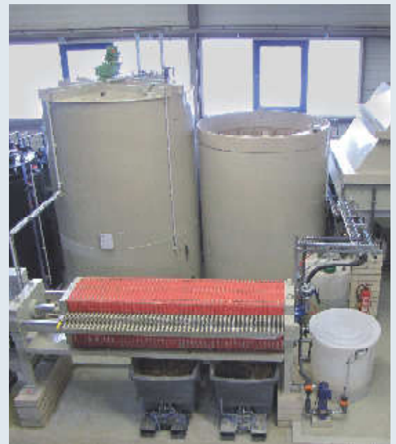
Waste Water Treatment Plant Zn/Ni