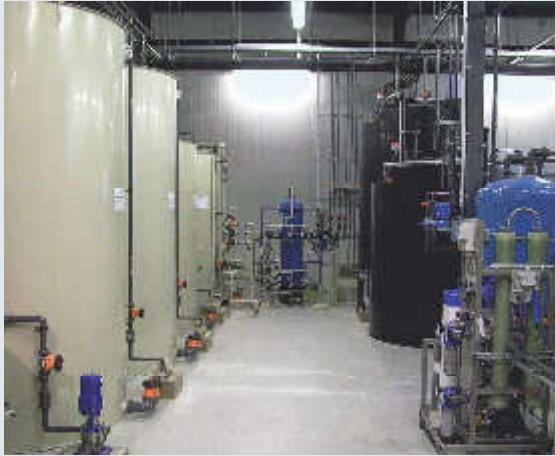
Waste Water Treatment Plant